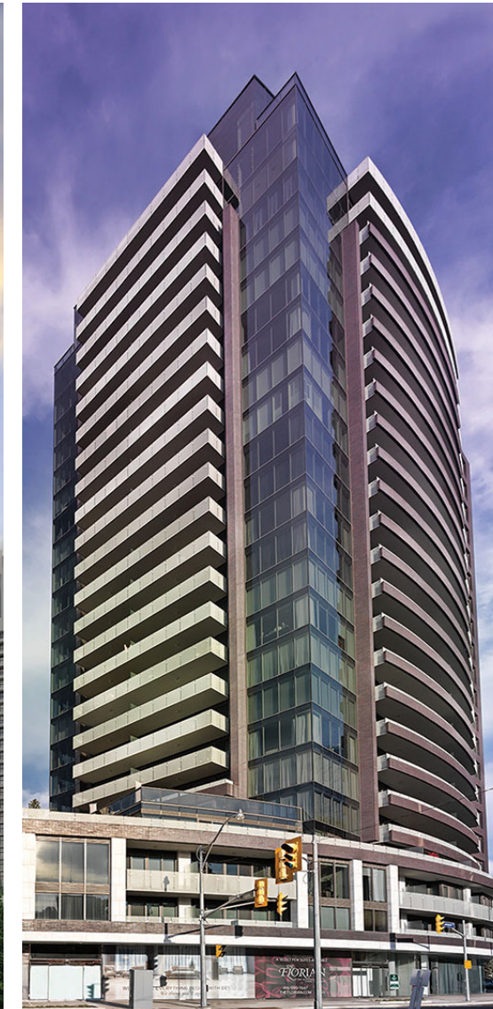
The Florian 88 Davenport Rd.