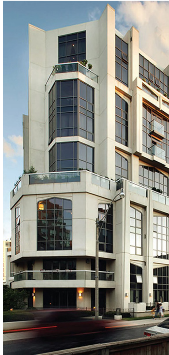
Domus in Yorkville 3 McAlpine St.