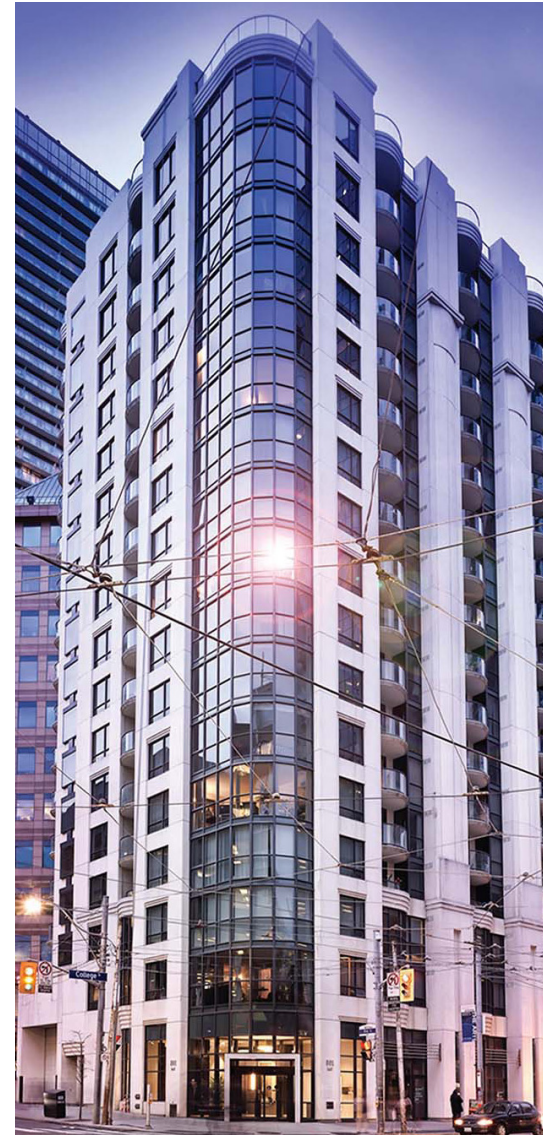
The Royalton 801 Bay St.