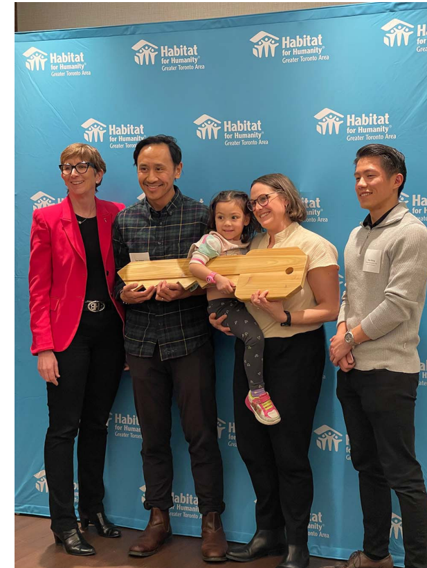
Habitat for Humanity Welcome Home Event at Mirabella Condominiums

Our projects consistently enhance the communities around them not only with strategic built form but also with our timeless, elegant building designs, with the incorporation of public art and by providing elegantly designed spaces. At Mirabella Condominiums, we installed “Motion in Air (Ma)” , a large artwork designed by Jennifer Macklem and made up of over 500, custom and unique aluminum panels. This beautiful installation is seen by over 150,000 people per day travelling along the Gardiner Expressway and perfectly integrates with the building’s design and natural surroundings, celebrating and enhancing the environment while using durable, eco-friendly materials.