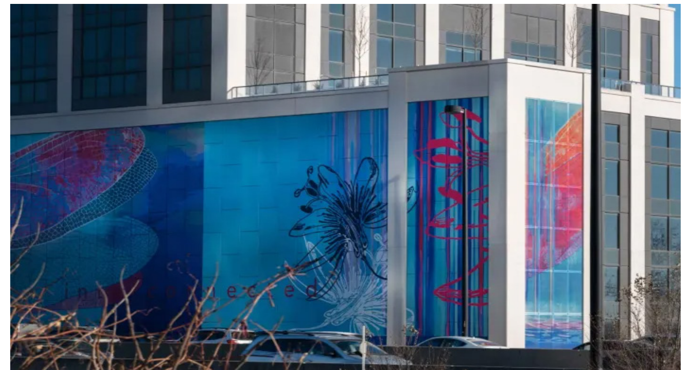
“Motion in Air” Public Art at Mirabella Condominiums