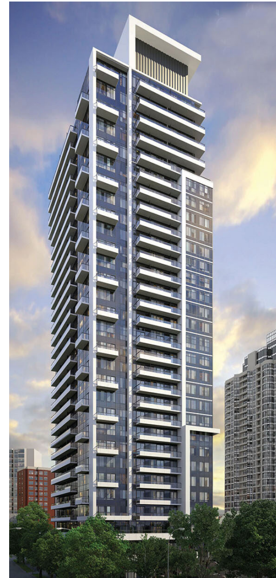
The Diamond 75 Canterbury Pl.

Our projects have consistently received accolades and awards for their superior design, craftsmanship, and attention to detail, most notably, the company was a three time winner of the coveted Grand Sam Award for Project of the Year from the Greater Toronto Home Builders Association, an unprecedented feat.