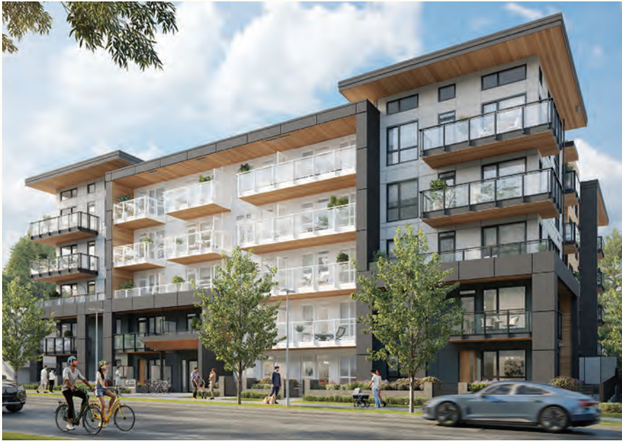
145 - 153 E. 4th Street | North Vancouver