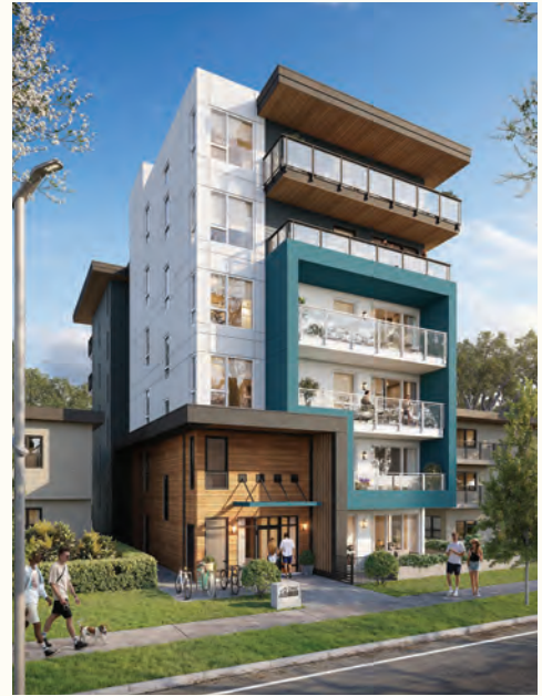
133 E. 4th Street | North Vancouver

Three Shores is a quintessentially local North Shore developer with a deeply-ingrained sense of community. The team's collective years of experience in adding value to the communities they know and love is reflected in their development philosophy, which is centred around elevating neighbourhoods to be timeless, livable, and long-lasting so that communities can flourish.