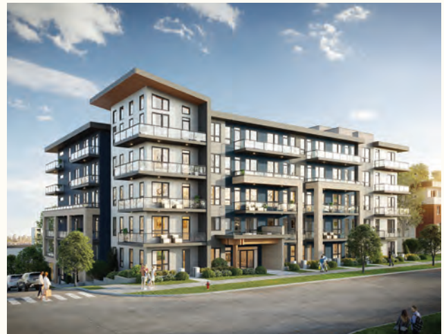
275 E. 2nd Street | North Vancouver

One20 is a testament to their unwavering commitment to this philosophy - to improve the neighbourhood and to add value in a manner that is sustainable and holistic.