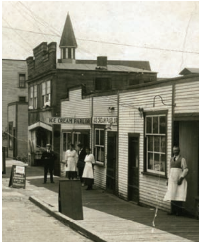
POCO CIRCA 1912