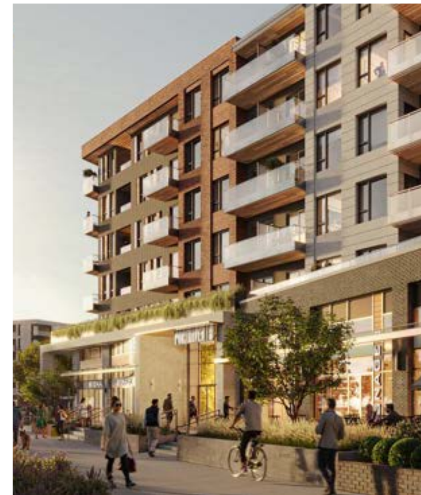
A NEW VISION

Downtown Port Coquitlam is discovering a new energy that respects its past, but charts a bright new future.