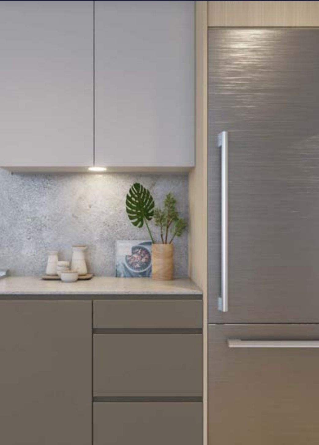
Tonal and material shifts. The clean white uppers and darker more grounded lowers are unified by mid-tone wood laminate millwork.

Good design is also beautifully functional. We consider the storage needs of each suite carefully and curate important details like under sink waste centres, cabinet lazy susans, and removable cutlery dividers. Cooling available for your year around comfort.