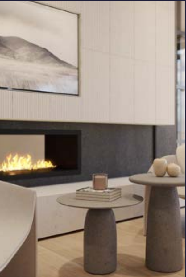
The lounge is all about opposites. Light and dark. Concrete and soft fabric. Fixed wood grain and shifting flame.

Our car share has a dedicated parking spot so there'll almost always be one close by.