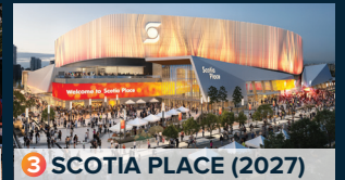
3 SCOTIA PLACE (2027)