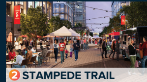
2 STAMPEDE TRAIL