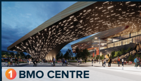
1 BMO CENTRE