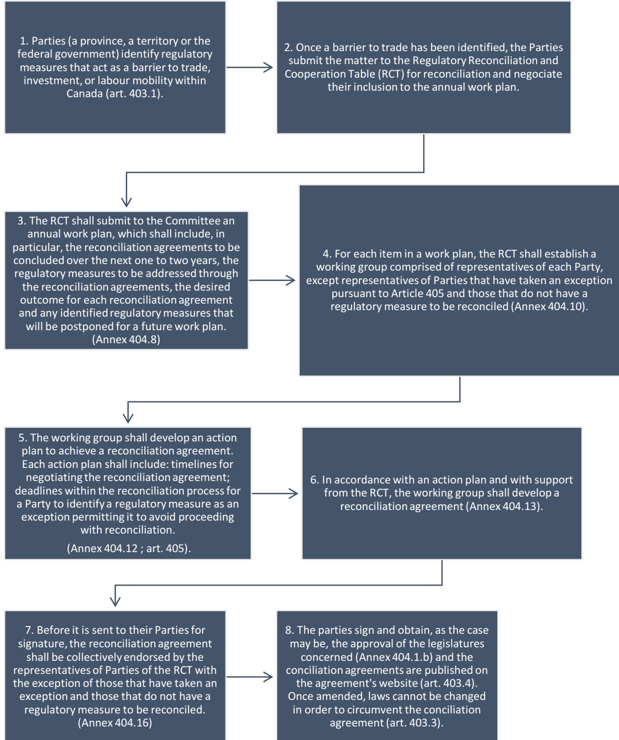
Figure 2 - The RCT's reconciliation process

representative. Note that the RCT plays a central role in the reconciliation process, as depicted in the following diagram: