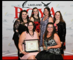
Business of the Year Awards 2019

Please Join Us for The Business of the Year Awards! A celebration of entrepreneurship!