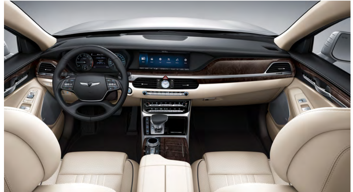
BEIGE NAPPA LEATHER WITH ASH WOOD TRIM