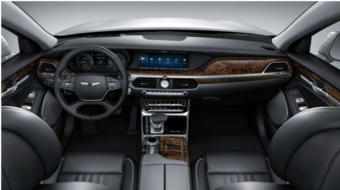
BLACK NAPPA LEATHER WITH WALNUT WOOD TRIM