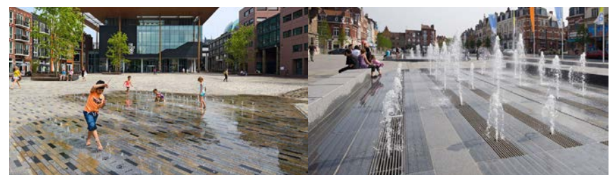
WATER FEATURE + WATER PLAY