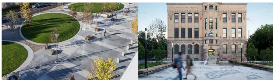
SPACE FOR COMMUNAL GATHERING

(From the Old Victoria Hospital Lands Secondary Plan)