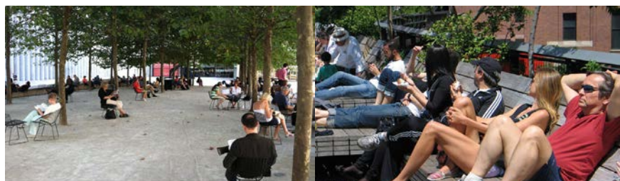
SEATING + LOUNGING