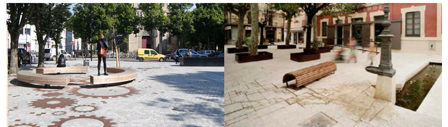
HERITAGE INTERPRETATION + INTEGRATION