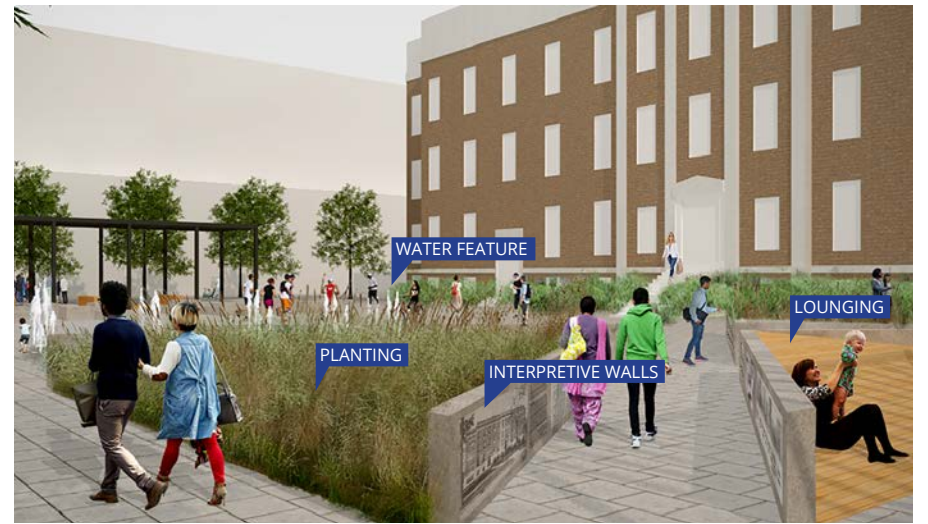
View looking west from South St. and Colborne St.