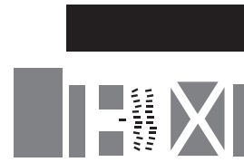
Yoga: 25 people