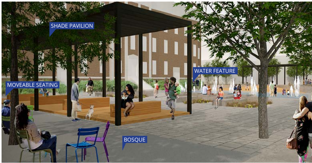
View looking north from South St.