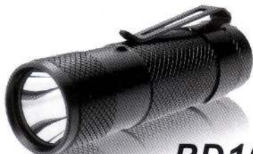
PD10 Max 190 Lumens

Fenix PD10 is a keychain flashlight with powerful output. It features compact size, high brightness and light weight, which embodies the most innovative design concept of Fenix. PD10 is easy to carry by inheriting Fenix EDC light design concept, meanwhile, its max 190 lumens output and 3 levels of brightness makes PD10 comparable with flashlight of medium size to meet your versatile lighting demands.