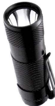
PD10 Max 190 Lumens

Unscrew the head to insert the batteries with the anode side (+) toward the lights head, screw the head back on to test.