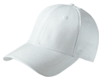
WHITE No PMS