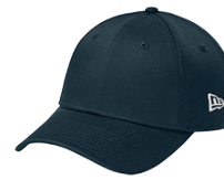
FLAG DEEP NAVY 296C