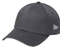
FLAG GRAPHITE 424C