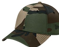
FLAG CAMO No PMS

To protect its reputation and identity, NEW ERA® reserves the right to prohibit the addition to any NEW ERA® product any trademark, name, design or logo that does not meet the high standards of the brand. The decoration of any NEW ERA® products with the proprietary mark, name or logo of any professional athletic organization or collegiate institution or other third party without the appropriate license and/or authorization of the organization or institution or third party is expressly prohibited. NEW ERA® products may not be resold without embellishment. NEW ERA® products are not permitted to be shipped to or sold outside of Canada.