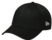
FLAG BLACK Neutral Black C

Textile fabric colours are subject to dye lot variation and will not be exact match to print Pantone reference.