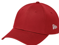
FLAG SCARLET 187C