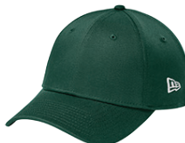
FLAG DARK GREEN 560C