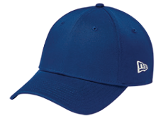
FLAG ROYAL 654C