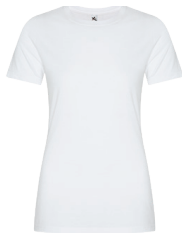
WHITE No PMS