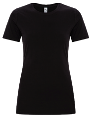
ONYX Black 6C

Textile fabric colours are subject to dye lot variation and will not be exact match to print Pantone reference.