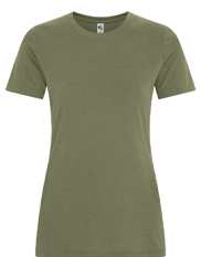
OLIVE GREEN 5763C