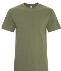
OLIVE GREEN 5763C