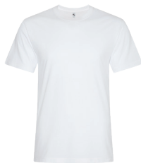
WHITE No PMS