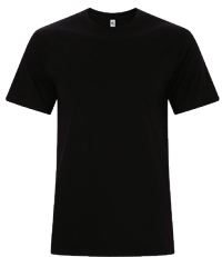
ONYX Black 6C

Textile fabric colours are subject to dye lot variation and will not be exact match to print Pantone reference.