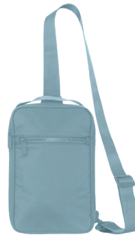
BLUE MIST 3526C