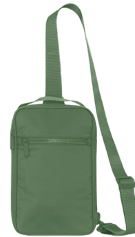
BALSAM GREEN 2409C