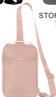
DUSTY ROSE 6029C