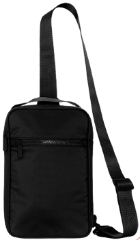
ONYX Black 6C

Textile fabric colours are subject to dye lot variation and will not be exact match to print Pantone reference