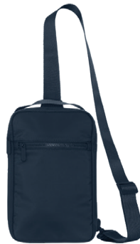
MIDNIGHT BLUE 4280C