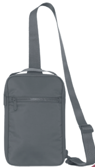
STORM GREY 7540C