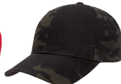
MULTICAM® BLACK* No PMS