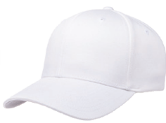
WHITE No PMS