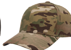
MULTICAM® No PMS