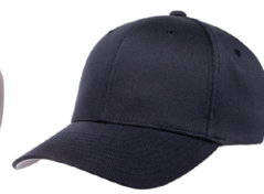
DARK NAVY 296C