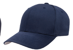
TRUE NAVY 533C