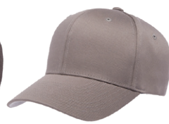
GREY Cool Grey 11C