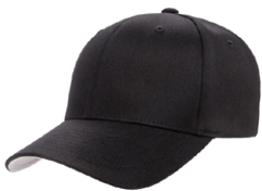
BLACK Neutral Black C

Textile fabric colours are subject to dye lot variation and will not be exact match to print Pantone reference.