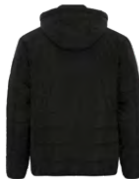
Full length inner storm flap