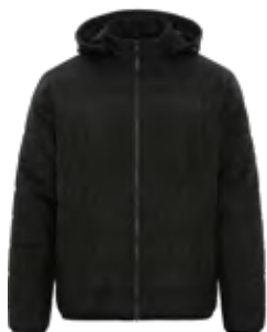
BLACK Black 6C

Textile fabric colours are subject to dye lot variation and will not be exact match to print Pantone reference