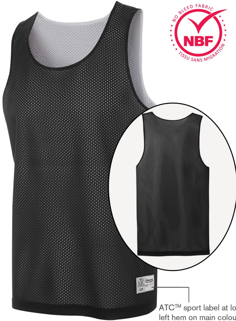
ATC™ sport label at lower left hem on main colour side