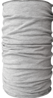
Cool Grey 4C