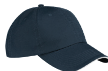
NAVY/WHITE 296C/No PMS