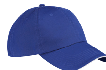
ROYAL/WHITE 294C/No PMS