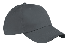
COAL GREY/BLACK Cool Grey 11C/Black 6C