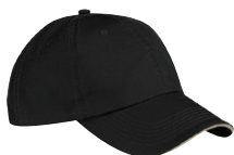
BLACK/KHAKI Black 6C/7530C

Textile fabric colours are subject to dye lot variation and will not be exact match to print pantone reference