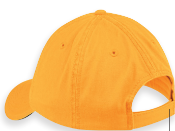
Adjustable hook and loop closure