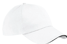
WHITE/NAVY No PMS/296C