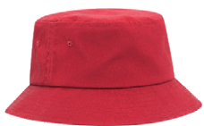
TRUE RED 200C