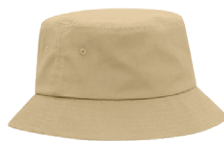
LIGHT KHAKI 4241C