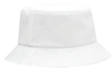
WHITE No PMS