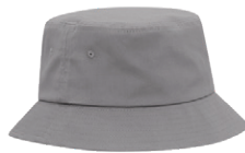
CONCRETE Cool Grey 8C