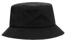
BLACK Black 6C

Textile fabric colours are subject to dye lot variation and will not be exact match to print Pantone reference