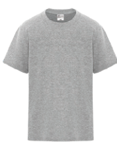
ATHLETIC HEATHER Cool Grey 5C