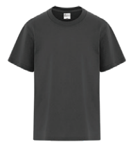
TEAM CHARCOAL 4294C