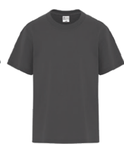
CHARCOAL Cool Gray 11C