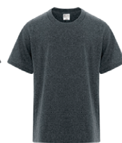
TEAM DARK HEATHER 7545C