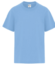
LIGHT BLUE 278C