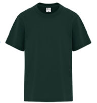
DARK GREEN 5467C