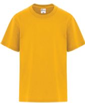
TEAM GOLD 1235C