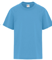
AQUATIC BLUE 2389C