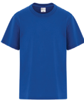
TEAM ROYAL 7686C