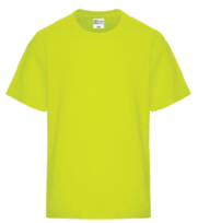
SAFETY GREEN 382C