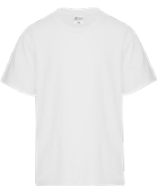
WHITE No PMS