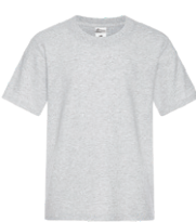
ASH GREY* Cool Grey 3C