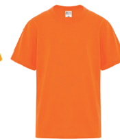
SAFETY ORANGE 021C