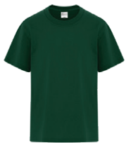
TEAM FOREST GREEN 5605C