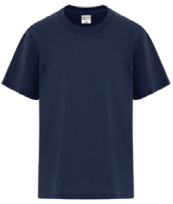
TEAM NAVY 533C