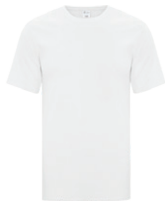
WHITE No PMS