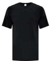
BLACK Black 6C

Textile fabric colours are subject to dye lot variation and will not be exact match to print Pantone reference.