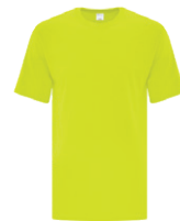
SAFETY GREEN** 382C