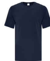
TEAM NAVY 215C