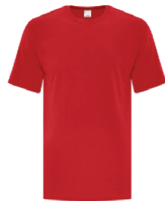
TEAM RED 199C