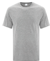
ATHLETIC HEATHER* Cool Grey 5C