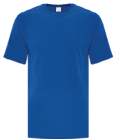
TEAM ROYAL 7686C