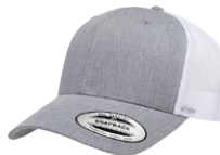
HEATHER/WHITE Cool Grey 9C/ No PMS