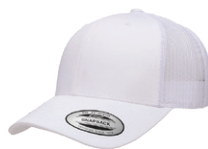
WHITE/WHITE No PMS/No PMS