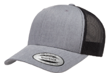
HEATHER/BLACK Cool Grey 9C/ Black 6C