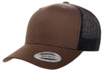
COYOTE BROWN/ BLACK 2320C/Black 6C