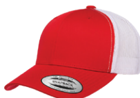
RED/WHITE 200C/No PMS