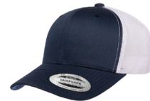
NAVY/WHITE 533C/No PMS