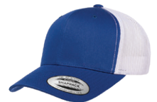
ROYAL/WHITE 7687C/No PMS