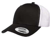
BLACK/WHITE Black 6C/No PMS