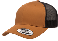
CARAMEL/BLACK 730C/Black 6C