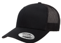
BLACK/BLACK Black 6C/Black 6C

Textile fabric colours are subject to dye lot variation and will not be exact match to print Pantone reference.