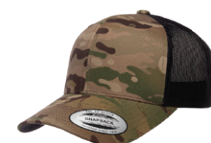
MULTICAM®*/BLACK No PMS/Black 6C