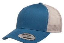
STEEL BLUE/SILVER 653C/423C