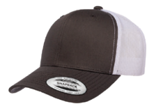
CHARCOAL/WHITE Cool Grey 11C/ No PMS