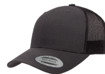
CHARCOAL/CHARCOAL Cool Grey 11C/ Cool Grey 11C