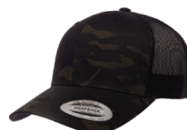
MULTICAM® BLACK*/BLACK No PMS/Black 6C