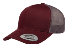
MAROON/GREY 7630C/Cool Grey 11C