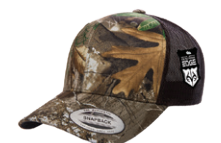
REALTREE EDGE®**/BROWN No PMS/2479C