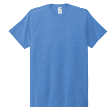
AZURE BLUE 279C