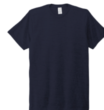
NIGHT SKY NAVY 533C