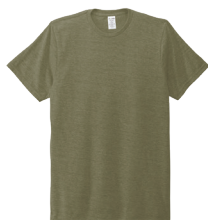
OLIVE YOU GREEN 5773C