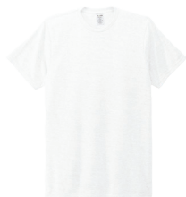
BRIGHT WHITE No PMS