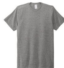
ALUMINUM GREY 423C