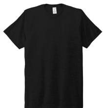
DEEP BLACK Black C

Textile fabric colours are subject to dye lot variation and will not be exact match to print Pantone reference.