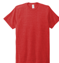
RISE UP RED 186C