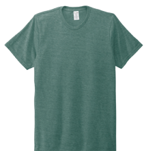
DEEP SEA GREEN 2217C