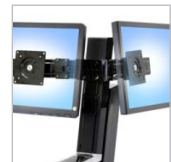
Hinged Bow for WorkFit-S 97-583-009 (black)