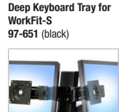
Deep Keyboard Tray for WorkFit-S 97-651 (black)