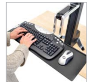
Large Keyboard Tray for WorkFit-S 97-653 (black)