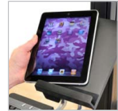
Tablet/Document Holder for WorkFit-S 97-558-200 (black) Includes lift handle