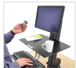
Worksurface for WorkFit-S 97-581-019 (black)