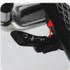
pull upward to adjust seat height