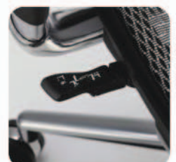
neutral position to lock seat depth, seat height and back angle