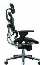
LE9ERG Black Leather