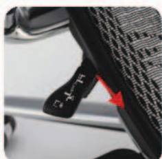
push forward to adjust seat depth