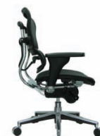
LE10ERGLO Black Leather