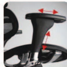
arm pad forward or backward & armrest height adjustment