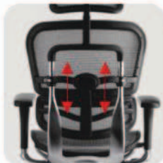
backrest height adjustment