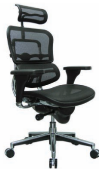
Mesh Seat & Backrest