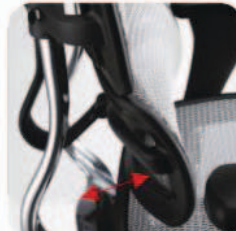
automatic flexible lumbar support