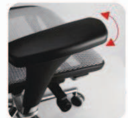
arm pad pivot adjustment