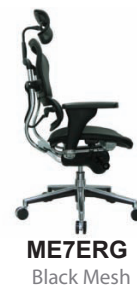
ME7ERG Black Mesh