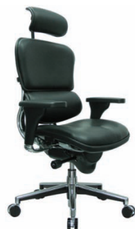
Leather Seat & Backrest