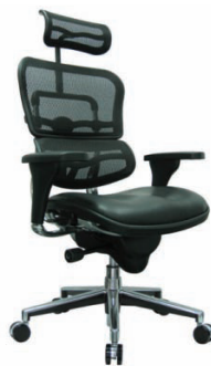
Mesh Seat Leather Backrest