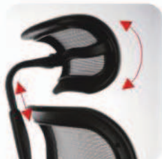
headrest height & angle adjustment