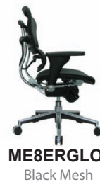
ME8ERGLO Black Mesh