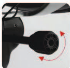
rotate knob to adjust backrest tilt tension