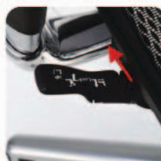
pull backward to adjust angle of the backrest