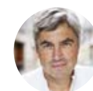
The Edward J. Tabah Visiting Professor in Surgical Oncology April 17 & 18, 2019

The Dr. Sharon Wexler Visiting Professor in Neuro-Oncology