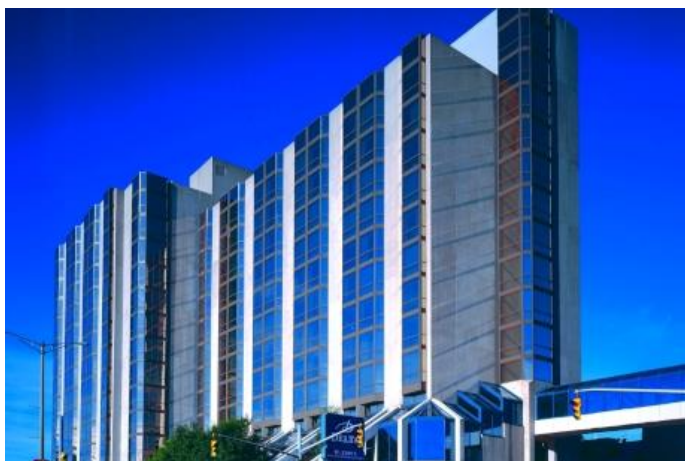
Delta St. John's Hotel

Optional pre-trip hotel on June 22, 2022: