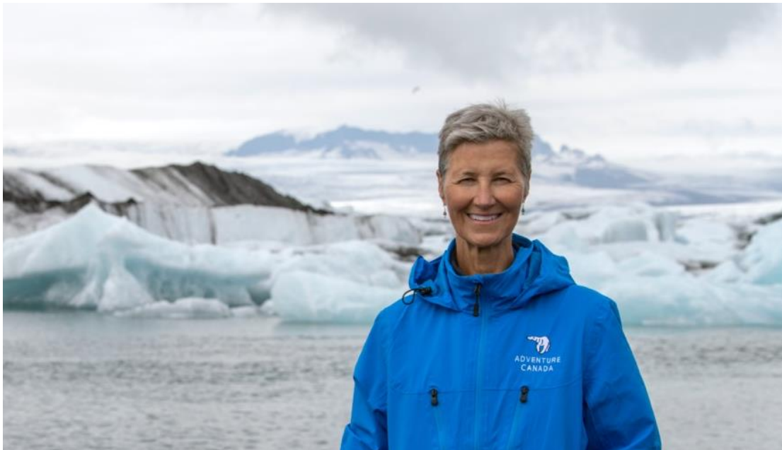
Adventure Canada Expedition Jacket By: Michelle Valberg

To make sure you stay completely dry and warm during your expedition, all passengers are required to bring their own pair of waterproof pants, and encourage to pack layers which are easily adjusted to ensure your overall comfort and safety. For more tips on what to pack, please see the Suggested Packing List in your Adventurer Package.